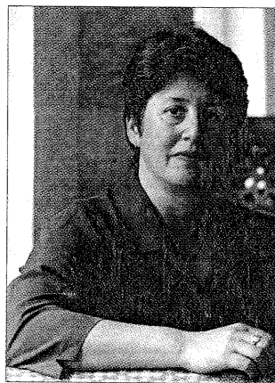
COPPEL: 'I realized that what I lacked was Jewish community'